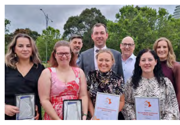
Pictured: The Barwon Health Finance team.

My career has seen some variations, but these have alwaus been occasions where I have grown as a person and developed professionally. My retirement from Barwon Health has happened recently and I have very much appreciated all the opportunities that the institution has offered me.