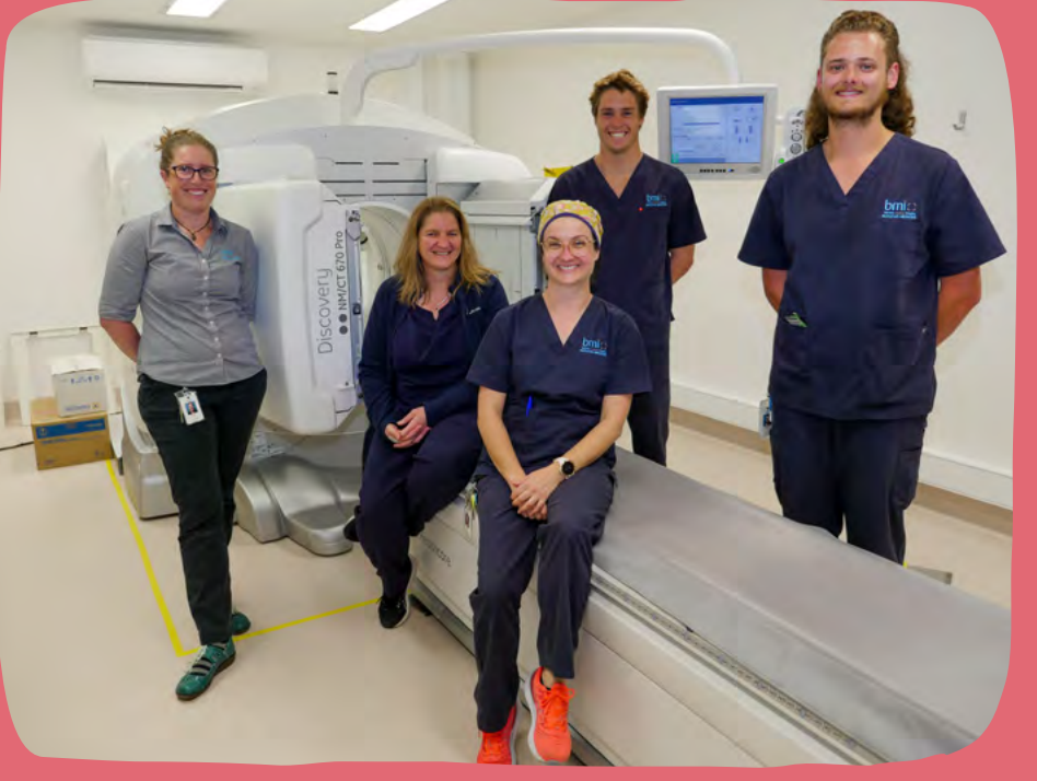
ictured: Members of the Nuclear Medicine team in the new space.

Co-location of the Nuclear Medicine department now paves the way for further building works on Level 1, facilitating the installation of a second interventional suite due for completion in August 2023.